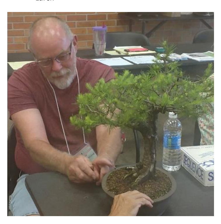
Nice movement but he needs to find the front yet.