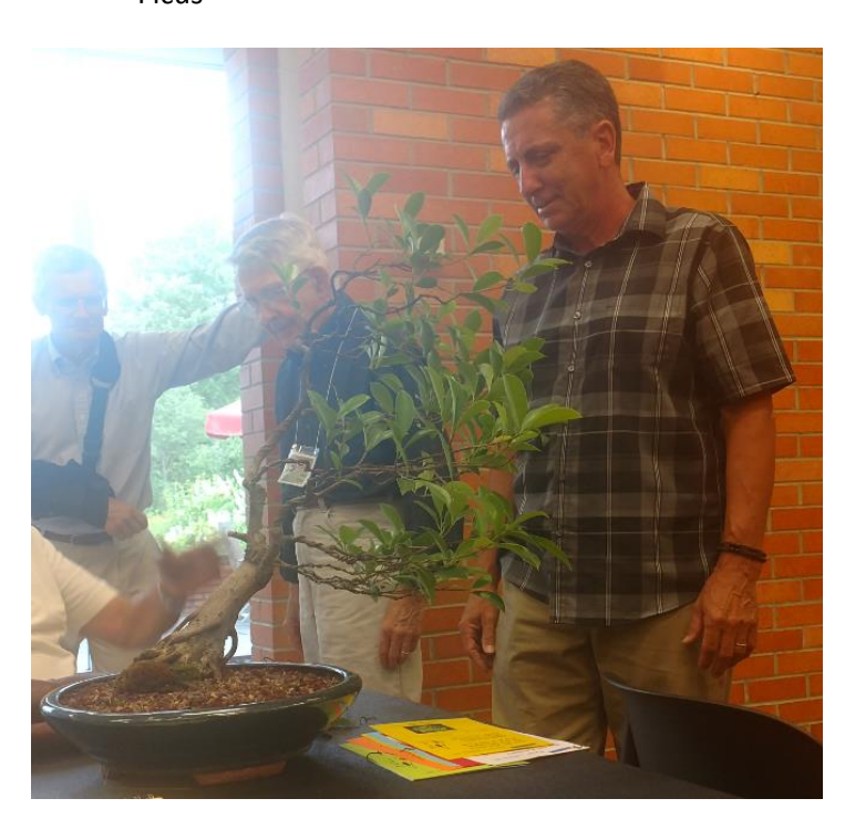
Continue to wire it, remove the present one and put new wires.