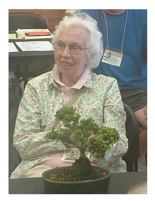
Put it in a pot with more soil, roots have to be a bit higher and to be a bit more covered.