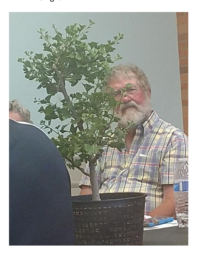
Cut the larger branches and try to keep them back.