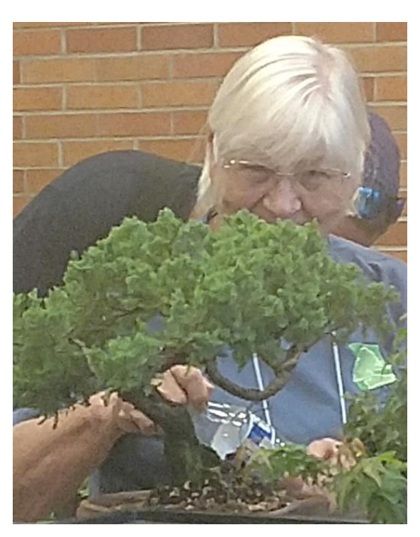
Put wire and try to keep the larger branches in the back.